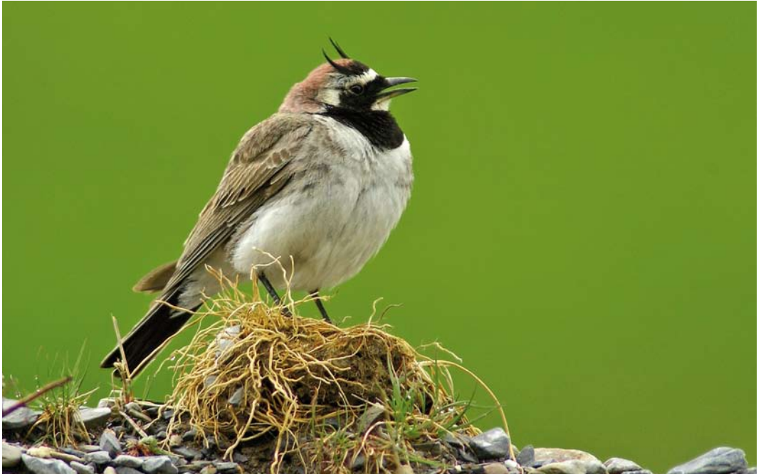
236 Caucasian Horned Lark / Kaukasische Strandleeuwerik Eremophila penicillata , Kazbegi, Georgia, 26 June 2005