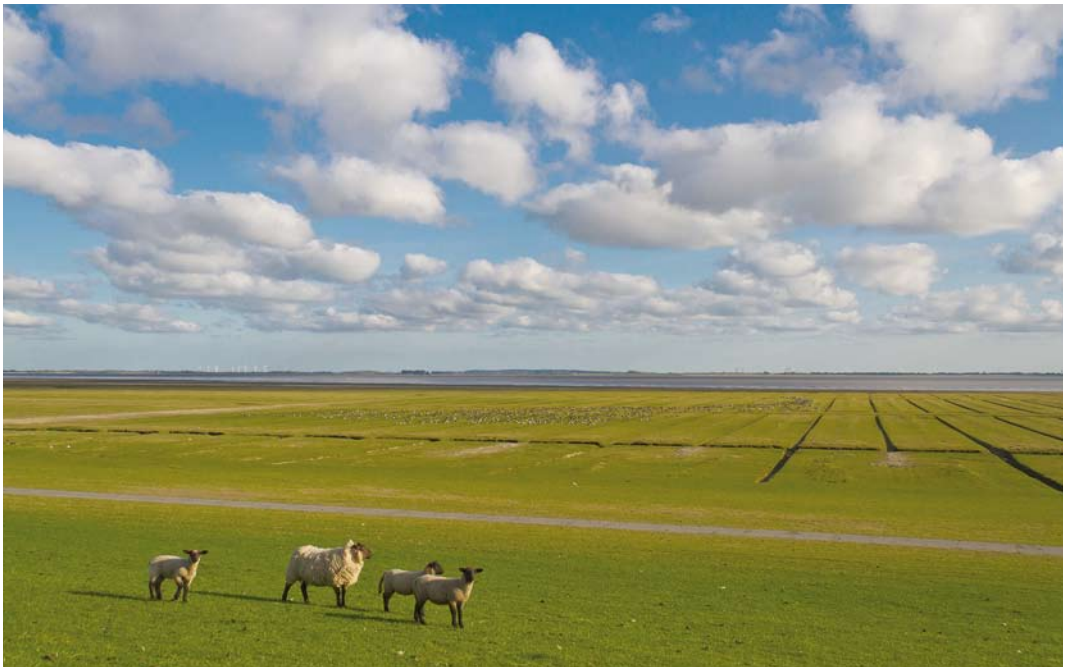
179 Breeding site of Gull-billed Terns Gelochelidon nilotica at Neufelderkoog, Schleswig-Holstein, Germany, 3 May 2014

In the Netherlands, Gull-billed Tern was an occasional breeder in the 20th century, the last breeding year being 1958 (at Harderwijk, Gelderland, and Swifterbant, Flevoland; van den Berg & Bosman 2001, Bijlsma et al 2001, van Dijk et al 2007). The most regular breeding site was nature reserve De Beer near Rotterdam, Zuid-Holland (destroyed in the 1960s by harbour expansions), where breeding occurred from the early 1930s to 1956 (van Oordt 1931, Strijbos 1931ab, Thijsse 1931, Kooijmans 1949, de Waard 1950ab, 1952; www.natuurmonumentdebeer.nl/vogels/vogels_lachstern.html ). It also bred in the 1940s at Wieringermeer, Noord-Holland (van Ijzendoorn 1948). Remarkably, a single pair did a breeding attempt at Balgzand, Noord-Holland, in 2005 but failed in the egg phase, possibly due to predation by Stoat Mustela erminea (van Dijk et al 2007; Ruud Vlek in litt). This area is the traditional post-breeding roosting area for birds from Denmark and Germany (see below).