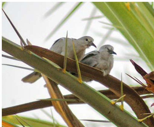
306 Eurasian Collared Doves / Turkse Tortels Streptopelia decaocto , fledglings, Awlad Margham, Libya, 19 August 2010 ( Jaber Yahia )

Breeding can be expected in other areas where good numbers of the species have been observed (see table 1). The possible impact of the spread of Eurasian Collared Dove through Libya on European Turtle Dove S turtur and Laughing Dove S senegalensis needs further investigation, as they are likely to compete for the same resources such as food and breeding sites.