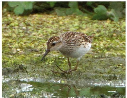
314 Egyptian Vulture / Aasgier Neophron percnopterus , Zandvoorde, West-Vlaanderen, Belgium, 22 April 2011 cf Dutch Birding 33: 203, 2011 315 Crested Honey Buzzard / Aziatische Wespindief Pernis ptilorhynchus , adult male, Villa San Giovanni, Calabria, Italy, 18 May 2011 316 Western Reef Heron / Westelijke Rirfeiger Egretta gularis , Embouchure de l'oued Ksob, Diabat near Essaouir, Morocco, 19 June 2011 317 Red-necked Stint / Roodkeelstrandloper Calidris ruticollis , adult, Utopia, Texel, Noord-Holland, Netherlands, 19 July 2011 318 White-rumped Sandpiper / Bonapartes Strandloper Calidris fuscicollis , Comacchio, Po delta, Italy, 17 July 2011 319 Long-toed Stint / Taigastrandloper Calidris subminuta , Braunschweiger Rieselfelder, Niedersachsen, Germany, June 2011