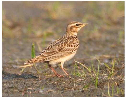
331 Sardinian Warbler / Kleine Zwartkop Sylvia melanocephala , male, Blåvandshuk, Vestjylland, Denmark, 15 June 2011 ( Henrik Knudsen ) 332 White-throated Sparrow / Witkeelgors Zonotrichia albicollis , second calendar-year, Helgoland, Schleswig-Holstein, Germany, 30 May 2011 ( Tobias Epple ) 333-334 Collared Flycatcher / Withalsvliegenvanger Ficedula albicollis , male, 152 km north-east of Dakhla, Western Sahara, Morocco, 11 April 2011 ( Wouter Faveyts ) 335 Great Spotted Cuckoo / Kuifkoekeok Clamator glandarius , juvenile, Evenreiterster, Groningen, Netherlands, 10 July 2011 ( Guido Meeuwissen ) 336 Bimaculated Lark / Bergkalanderleeuwerik Melanocorypha bimaculata , Magadino, Tessin, Switzerland, 5 May 2011 ( Marco Thoma ) cf Dutch Birding 33: 207, 2011