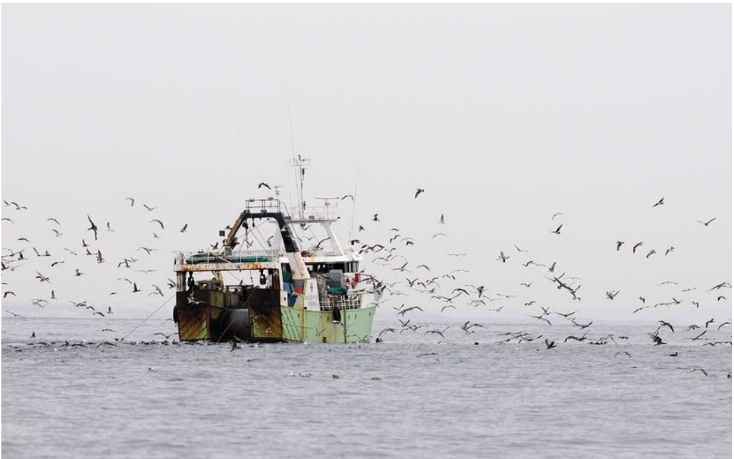
271 Trawler surrounded by seabirds, off southern Portugal, 23 September 2010

Since a few years, it has become more widely known that the area is also excellent for seawatching. Seabirds can be viewed well from Cabo de São Vicente – watching from the northern side of the headland in the morning being the preferred strategy (Walker 1997). Most northern Atlantic seabirds can be seen here and specialties record-