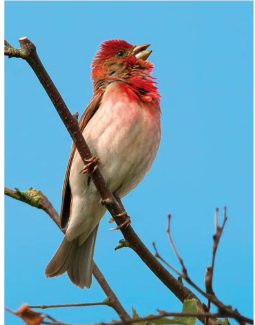
359 Slangenarend / Short-toed Snake Eagle Circaetus gallicus , Delleboersterheide, Friesland, 2 juni 2011 360 Roodmus / Common Rosefinch Carpodacus erythrinus , De Cocksdorp, Texel, Noord-Holland, 6 juni 2011 361 Roodmus / Common Rosefinch Carpodacus erythrinus , Grootte Keeten, Noord-Holland, 12 juni 2011