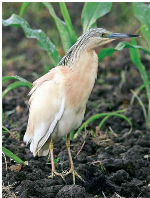
358 Groene Reiger / Green Heron Butorides virescens , Zijkanaal H-weg, Amsterdam, Noord-Holland, 1 juni 2007 (Chris van Rijswijk) 359 Ralreiger / Squacco Heron Ardeola ralloides , adult, Wieringen, Noord-Holland, 17 juni 2007 (Hans Brinks) 360 Ralreiger / Squacco Heron Ardeola ralloides , adult, Watergraafsmeer, Amsterdam, Noord-Holland, 22 juni 2007 (Laurens B Steijn)