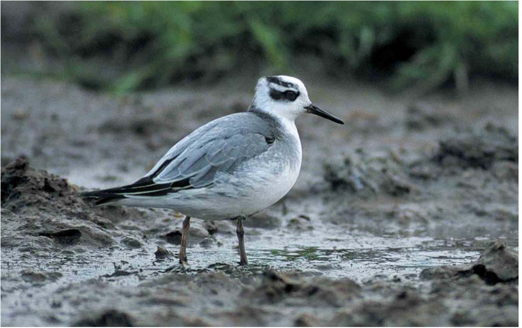
45 Rosse Franjepoot / Red Phalarope Phalaropus fulicaria , Zwaagwesteinde, Friesland, 10 november 2001 (Eric Koops)