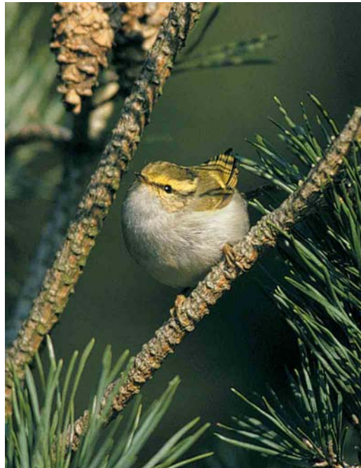
40 Pallas's Leaf Warbler / Pallas' Boszanger Phylloscopus proregulus , Amsterdamse Waterleidingduinen, Zandvoort, Noord-Holland, Netherlands, 9 January 2002

Pont del Través, l'Encanyissada lagoon, Ebro delta, on 16 November. Another was at Lotan, Israel, on 17-19 November. In England, singles were at Portland Bill on 15-17 November, in Greater London from mid-November to 29 December and at Porthgwarra, Cornwall, on 23 December. Another was reported from Ouessant, Finistère, France, on 30 December. The third Dusky Warbler P fuscatus for Spain was trapped at Sot del Fuster, Vilanova de la Barca, Lleida, on 15 November. In England, one remained at Sennen, Cornwall, from 16 November into January. Siberian Chiffchaffs P collybita tristis were reported from Cape Clear, Cork, on 4-11 November and from Helgoland on 12-19 November and 25 November. At least six were reported from England from 23 December into January. In Bull Br Ornithol Club 121: 281-296, 2001, Lars Svensson demonstrated that the type specimen of Iberian Chiffchaff P c brehmii is, in fact, a female Northern Chiffchaff P c collybita and that the correct name of Iberian Chiffchaff should be P ibericus . In the same paper, he presented a new discriminant formula for ringers by adding seven values which tend to be larger in Iberian and subtracting two which tend to be smaller compared with Common ( add wing length, bill length, distance p1-p2, distance wingtip-p6, distance wingtip-p7, distance wingtip-p10, distance wingtip-s1, and subtract tail length and distance p1-tips of primary coverts;