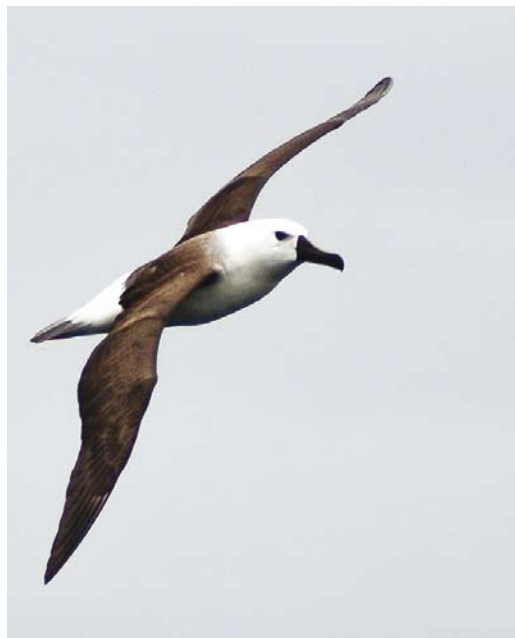
229 Atlantic Yellow-nosed Albatross / Geelneusalabartos Thalassarche chlororhynchos , second or third calendar-year, Grip, Kristiansund, Møre og Romsdal, Norway, 28 June 2007 (Bjørn Thomassen)

* African Openbill / Afrikaanse Gaper Anastomus lamelligerus