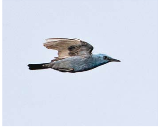
258 Blauwe Rotslijster / Blue Rock Thrush Monticola solitarius , eerste-zomer mannetje, Industrierterrein, Vlieland, Friesland, 26 april 2017 (Jaap Denee)

lippensis wordt gekenmerkt door de rode onderdelen bij een adult mannetje; vrouwtjes en onvolwassen vogels zijn donkerder dan vogels in West-Azië en Europa en vertonen vaak wat rossige tekening op de onderdelen. M s pandoo uit Centraal-Azië lijkt meer op de westelijke ondersoorten. M s madoci komt alleen voor in Maleisië en Indonesië en is duidelijk kleiner met een kortere staart dan de andere ondersoorten (Clement et al 2000). Zuccon & Ericson (2010) gaven op basis van fylogenetisch onderzoek aan dat de groep van drie oostelijke ondersoorten beter als aparte soort kan worden beschouwd (Aziatische Blauwe Rotslijster M philippensis ).