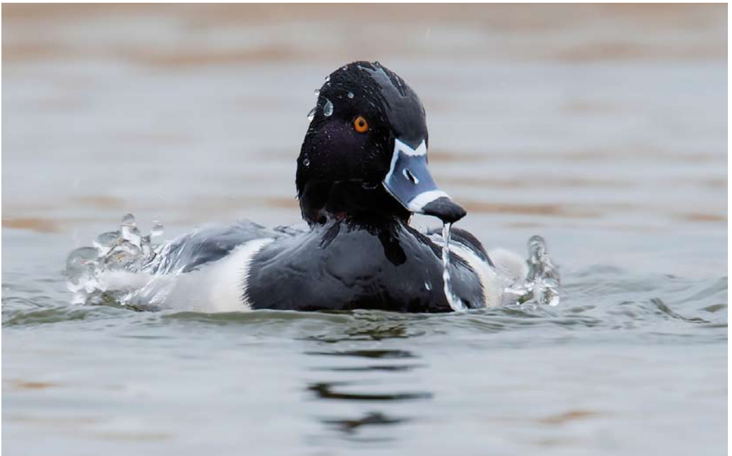
293 Ringsnaveleend / Ring-necked Duck Aythya collaris , adult mannetje, Appingedam, Groningen, 17 februari 2017 (Wies Vink)