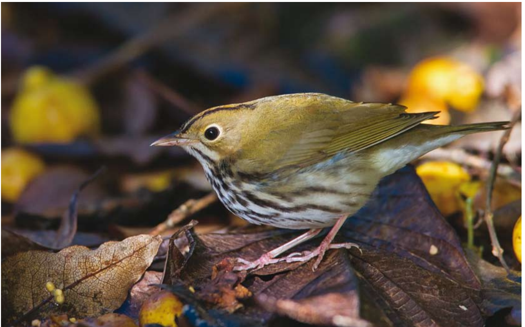
246 Ovenbird / Ovenvogel Seiurus aurocapilla , Ponta da Fajã, Flores, Azores, 23 October 2011 (Mika Bruun)