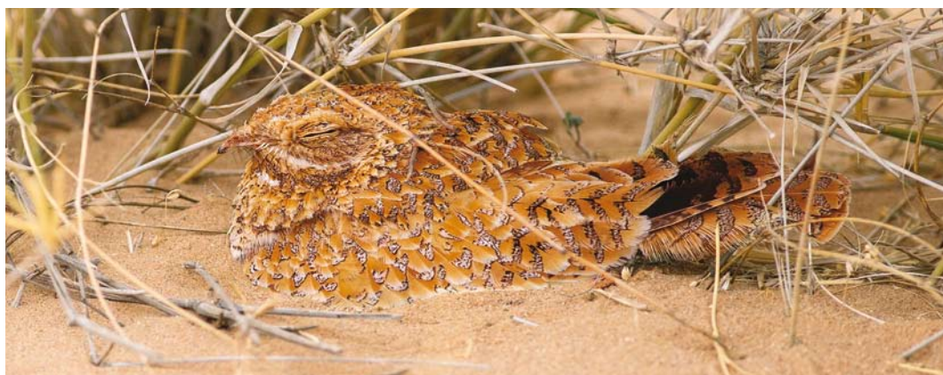
272 Blue-cheeked Bee-eater / Groene Bijeneter Merops persicus , Jandía, Fuerteventura, Canary Islands, 9 April 2017 273 White-backed Vulture / Witruggier Gyps africanus , adult, Bir Shalatayn, Egypt, 25 March 2017 274 Pied-billed Grebe / Dikbekfuut Podilymbus podiceps , adult, Venda Nova, Codeçoso, Montalegre, Portugal, 16 March 2017 275 Pectoral Sandpiper / Gestreepte Strandloper Calidris melanotos , Constantine, Algeria, 1 May 2017 276 Golden Nightjar / Goudgele Nachtzwaluw Caprimulgus eximius , Oued Jenna, Aousserd, Oued Ad-Deheb, Western Sahara, Morocco, 29 April 2017