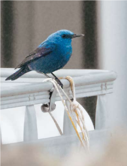
302 Blauwe Rotslijster / Blue Rock Thrush Monticola solitarius , eerste-zomer mannetje, Industrieterrein, Vlieland, Friesland, 26 april 2017

HOPPEN TOT STAARTMEZEN Vroege Hoppen Upupa epops werden opgemerkt op 4 maart bij Aarle-Rixtel, Noord-Brabant, en op 26 maart bij Westervoort, Gelderland. In april volgden er nog ten minste 10. Op 30 april vloog een groep van acht Bijeneters Merops apiaster laag over een grote groep tellers bij Breskens. Waarnemingen later deze dag in Zuid-Holland bij onder meer Ouddorp (zeven), Oostvoorne en Katwijk hadden mogelijk betrekking op vogels uit deze groep. Vanaf half april kwamen uit in totaal 83 uurhokken meldingen van Draaihalzen Jynx torquilla . De eerste-winter Bruine Klauwier Lanius cristatus die vanaf 19 februari in Den Helder, Noord-Holland, verbleef werd voor het laatst gezien op 7 maart. Een Roodstuitzwaluw Cecropis daurica liet zich van 22 tot 29 april uitgebreid bekijken in De Cocksorp op Texel, Noord-Holland; zelden was deze soort zo lang twitchbaar op één plaats. Van c 20 plekken verspreid over het land kwamen meldingen van kleine aantallen Witkopstaartmezen Aegithalos caudatus caudatus .