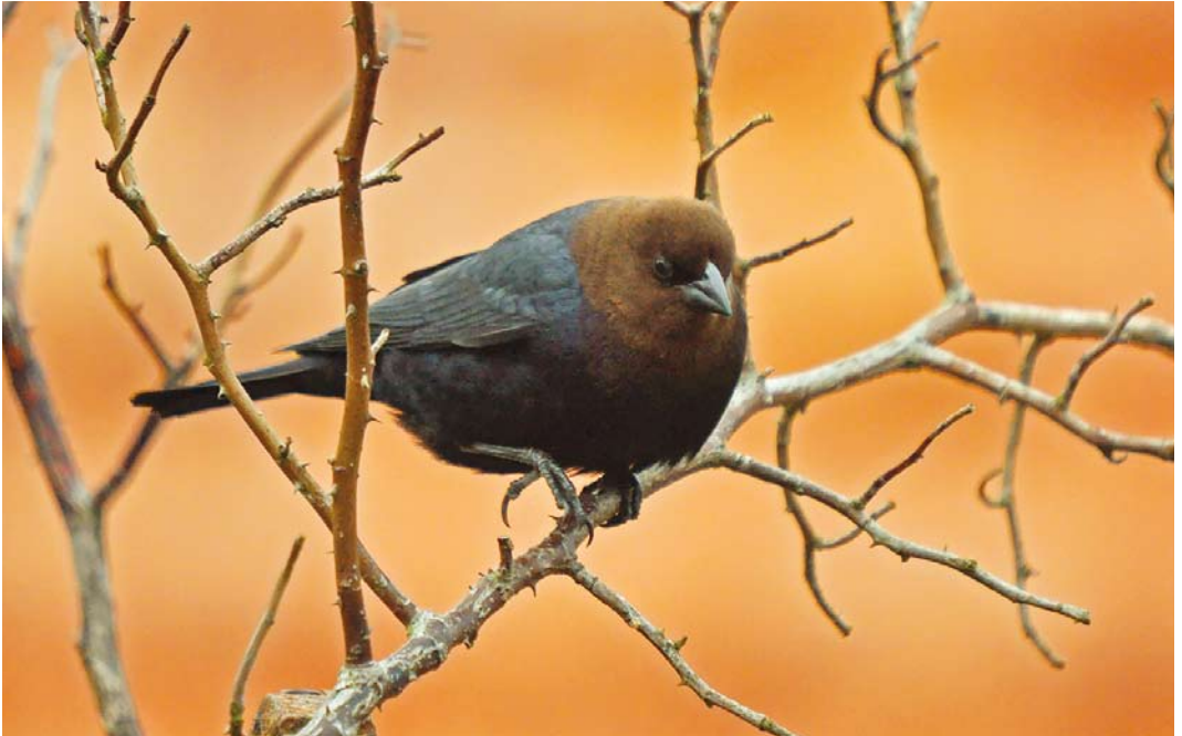
245 Brown-headed Cowbird / Bruinkopkoevogel Molothrus ater , male, Ouzouër-sur-Trézée, Loiret, France, 4 May 2010 (Yves Danjon)