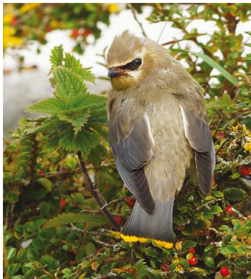
240 Cedar Waxwing / Cederpestvogel Bombycilla cedrorum , juvenile, Vaul, Tiree, Argyll & Bute, Scotland, 28 September 2013 ( Jim Dickson )

Grey Catbird / Katvogel Dumetella carolinensis