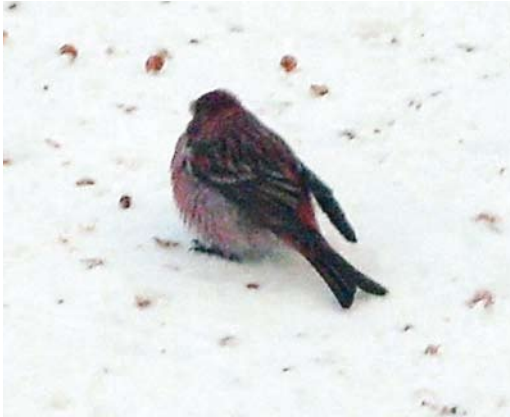
198 Pallas's Rosefinch / Pallas' Roodmus Carpodacus roseus , male, Ulyanovsk, Russia, 25 January 2011 ( Galina Pilyugina ). Same bird as plate 199.