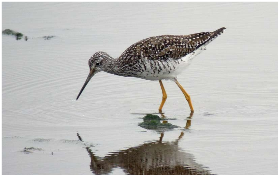
345 Grote Geelpootruiter / Greater Yellowlegs Tringa melanoleuca , eerste-zomer, Bokkegat, Wissenkerke, Zeeland, 26 juni 2011 ( Kris De Rouck )