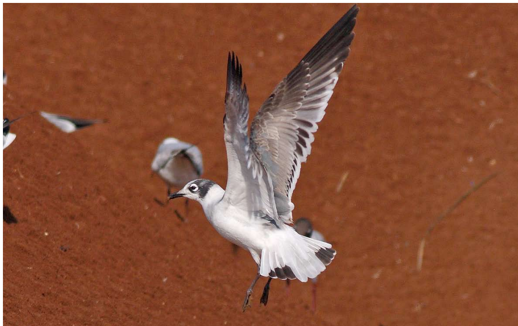
322 Franklin's Gull / Franklins Meeuw Larus pipixcan , second-summer, Delitzsch, Sachsen, Germany, 6 May 2011 (Jürgen Steudtner)