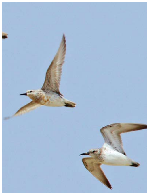
311 Presumed Eastern Common Tern / vermoedelijke Oostelijke Visdief Sterna hirundo longipennis, with Common Tern / Visdief S. h. hirundo, Heist, West-Vlaanderen, Belgium, 22 June 2011 312 Red Knot / Kanoet / Calidris canutus, with Great Knot / Grote Kanoet C. tenuirostris, Bandar Abbas, Hormozgan, Iran, 18 May 2011 313 Brown Noddy / Noddy Anous stolidus, Persian Gulf, Iran, 7 June 2011