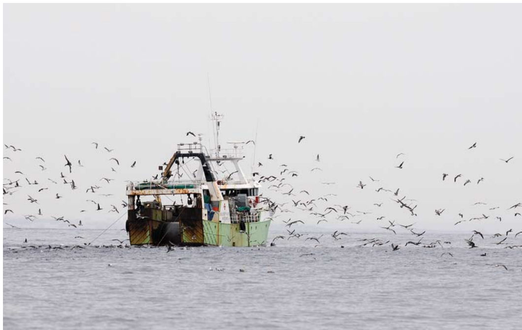
271 Trawler surrounded by seabirds, off southern Portugal, 23 September 2010 (Roef Mulder)

Since a few years, it has become more widely known that the area is also excellent for seawatching. Seabirds can be viewed well from Cabo de São Vicente – watching from the northern side of the headland in the morning being the preferred strategy (Walker 1997). Most northern Atlantic seabirds can be seen here and specialties record-