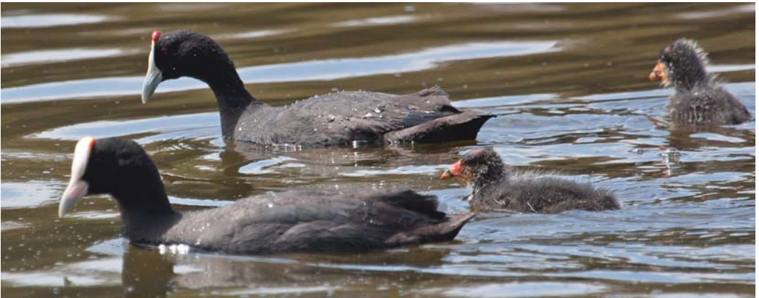
300 Hybrid Eurasian x Red-knobbed Coot / hybride Meerkoet x Knobbelmeerkoet Fulica atra x cristata , Sidi Bou-Rhaba, Morocco, 25 April 2009 (Peter Adriaens). Upper edge of frontal shield is straight and slightly notched (as in Red-knobbed) but shield is pinched at base due to pointed black feathering (as in Eurasian). 301 Hybrid Eurasian x Red-knobbed Coot / hybride Meerkoet x Knobbelmeerkoet Fulica atra x cristata , Sidi Bou-Rhaba, Morocco, 25 April 2009 (Peter Adriaens). Close-up of head and bill. Note mixed bill colours, vestigial red knobs and pointed wedge of black feathering. 302 Hybrid Eurasian x Red-knobbed Coot / hybride Meerkoet x Knobbelmeerkoet Fulicatra atra x cristata (foreground), with Red-knobbed Coot and two chicks, Sidi Bou-Rhaba, Morocco, 25 April 2009 (Peter Adriaens). In comparison with Red-knobbed, hybrid shows thicker neck and flatter head, reminiscent of Eurasian.

Red-knobbed is a vagrant and Eurasian a winter visitor. Diskin (2005) reported a Red-knobbed breeding at Al Warsen lake near Dubai, United Arab Emirates, 'perhaps mated with Fulica atra '. Two years later, on 5 December 2007, a hybrid was photographed at Al Warsen lake, which looked very similar to the Sidi Bou-Rhaba bird (Wilby 2007). Al Warsen Lake is the only site in Asia where Red-knobbed occasionally breeds. McCarthy (2006) does not report any case of hybridization between Eurasian and Red-knobbed.