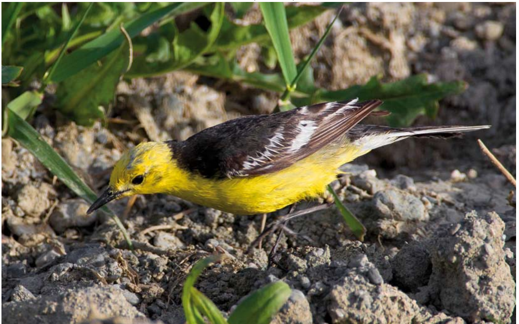
328 Black-backed Citrine Wagtail / Zwartrugcitroenkwikstaart Motacilla citreola calcarata , first-summer male, Van marshes, East Anatolia, Turkey, 18 May 2011