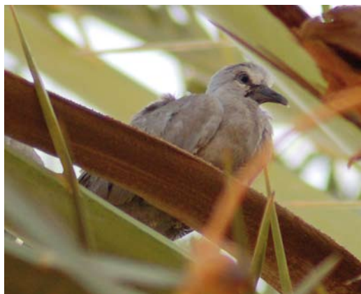
305 Eurasian Collared Dove / Turkse Tortel Streptopelia decaocto , fledgling, Awlad Margham, Libya, 18 August 2010