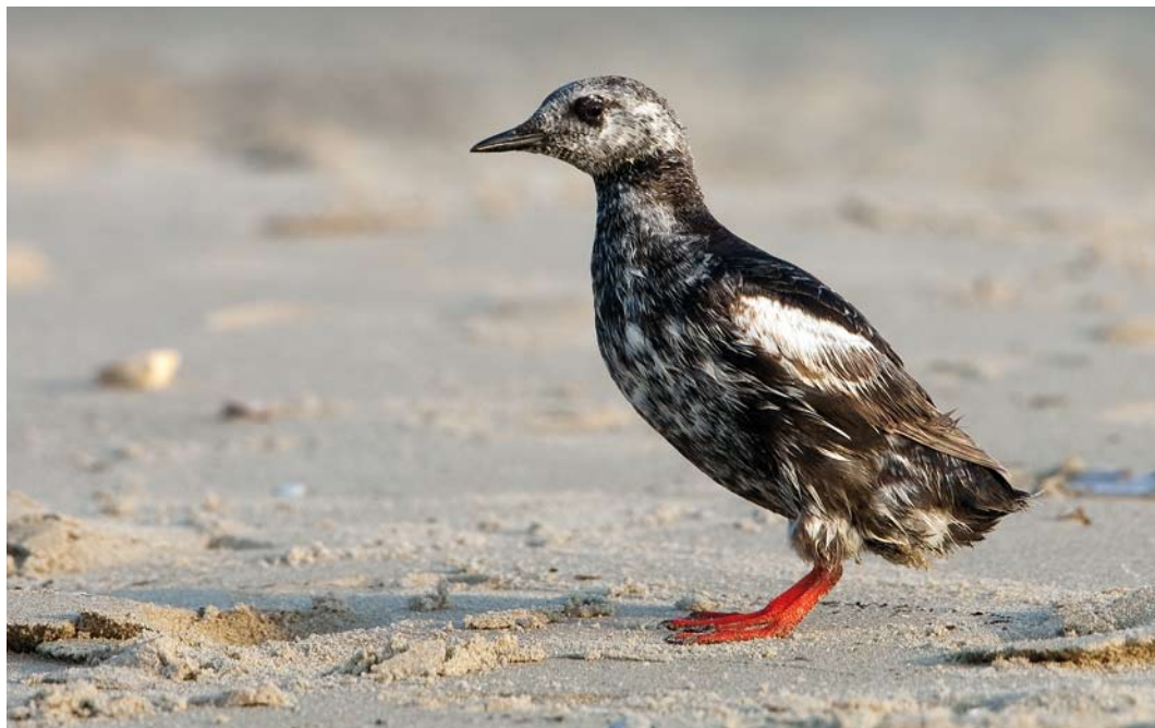
341 Zwarte Zeekoet / Black Guillemot Cephus grylle , eerstejaars, De Cocksdorp, Texel, Noord-Holland, 7 mei 2011