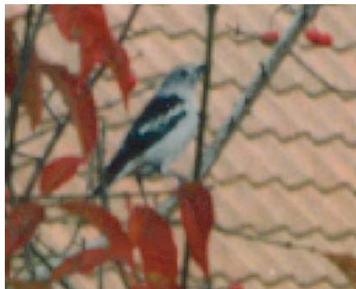
291 Daurische Spreeuw / Daurian Starling Agropsar sturninus , Duiven, Gelderland, 5 November 1999 (A J Meeuwissen)

GEDRAG & CONDITIE Opvliegend bij benadering en dan in ander bosje landend. Verenkleed zonder zichtbare