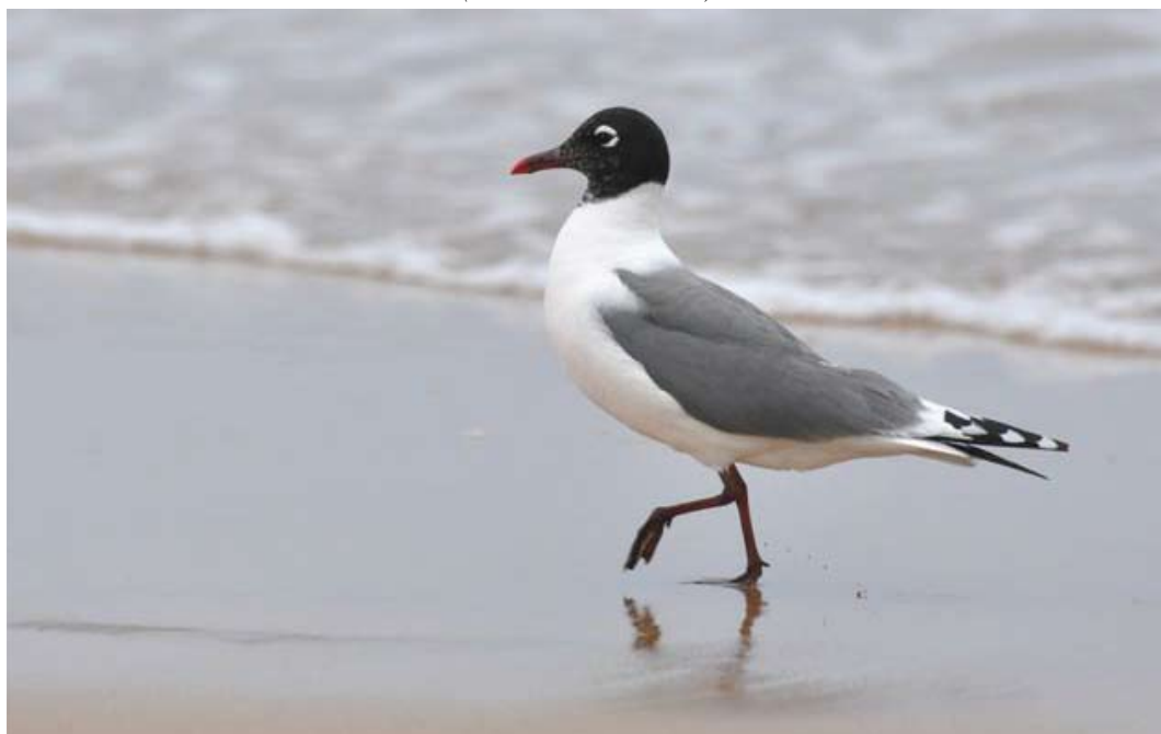
323 Franklin's Gull / Franklins Meeuw Larus pipixcan , adult, Aghroud plage, Haha, Morocco, 16 June 2011 (Suzanne Bonmarchand)