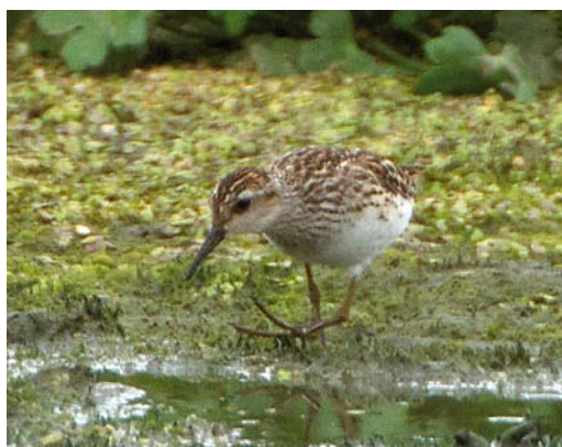
314 Egyptian Vulture / Aasgier Neophron percnopterus , Zandvoorde, West-Vlaanderen, Belgium, 22 April 2011 cf Dutch Birding 33: 203, 2011 315 Crested Honey Buzzard / Aziatische Wespindief Pernis ptilorhynchus , adult male, Villa San Giovanni, Calabria, Italy, 18 May 2011 316 Western Reef Heron / Westelijke Rirfeiger Egretta gularis , Embouchure de l'oued Ksob, Diabat near Essaouir, Morocco, 19 June 2011 317 Red-necked Stint / Roodkeelstrandloper Calidris ruficollis , adult, Utopia, Texel, Noord-Holland, Netherlands, 19 July 2011 318 White-rumped Sandpiper / Bonapartes Strandloper Calidris fuscicollis , Comacchio, Po delta, Italy, 17 July 2011 319 Long-toed Stint / Taigastrandloper Calidris subminuta , Braunschweiger Rieselfelder, Niedersachsen, Germany, June 2011