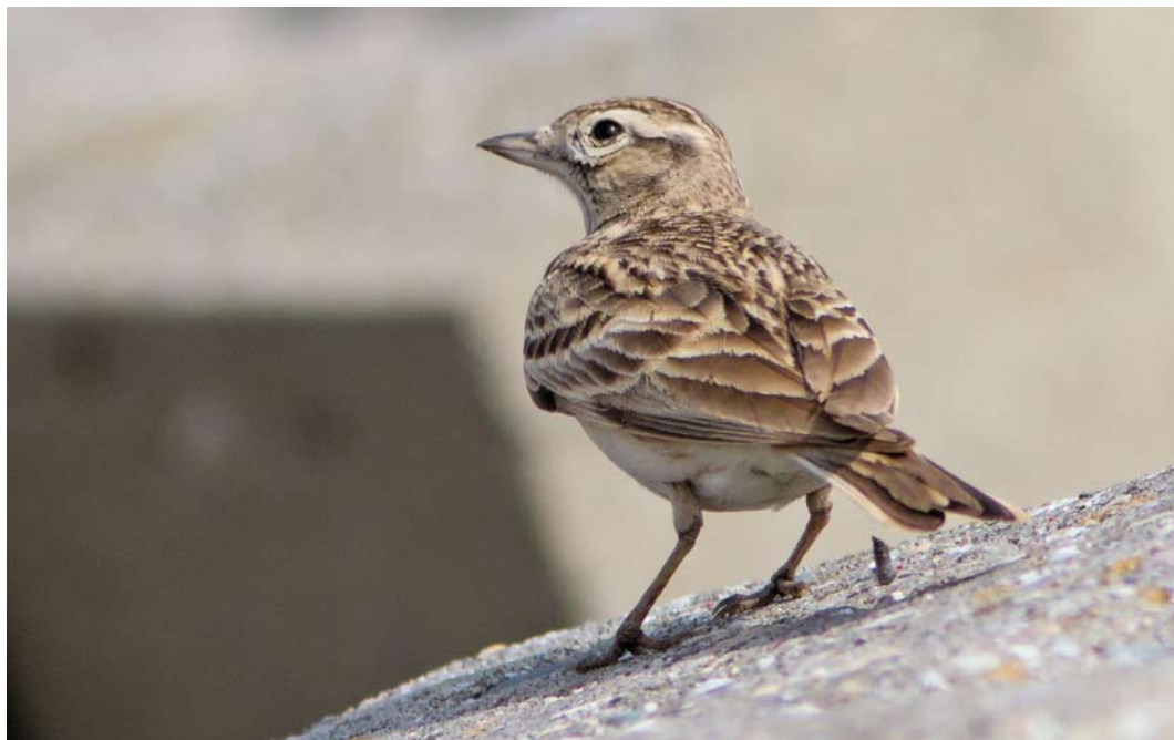
355 Kortteenleeuwerik / Greater Short-toed Lark Calendrella brachydactyla , Camperduin, Noord-Holland, 7 mei 2011