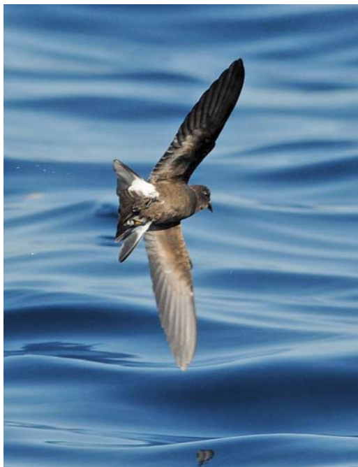
281 Wilson's Storm Petrel / Wilsons Stormvogeltje Oceanites oceanicus , off southern Portugal, 22 September 2009