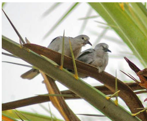
306 Eurasian Collared Doves / Turkse Tortels Streptopelia decaocto , fledglings, Awlad Margham, Libya, 19 August 2010 (Jaber Yahia)

Breeding can be expected in other areas where good numbers of the species have been observed (see table 1). The possible impact of the spread of Eurasian Collared Dove through Libya on European Turtle Dove S turtur and Laughing Dove S senegalensis needs further investigation, as they are likely to compete for the same resources such as food and breeding sites.