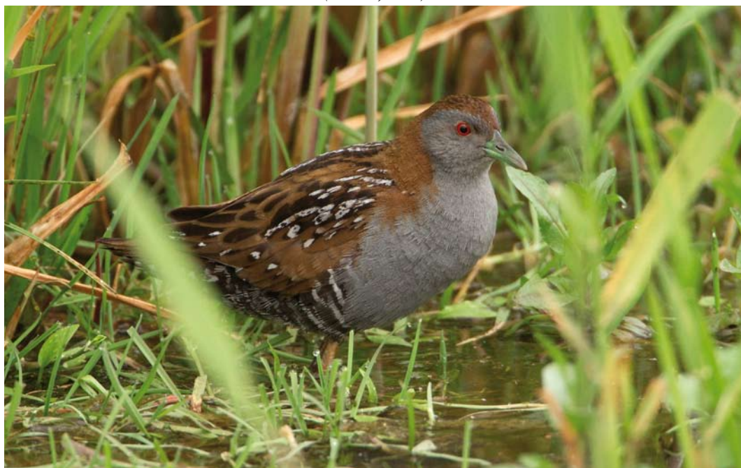
342 Kleinst Waterhoen / Baillon's Crane Porzana pusilla , Schokland, Flevoland, 6 juni 2011 (Roland Jansen)