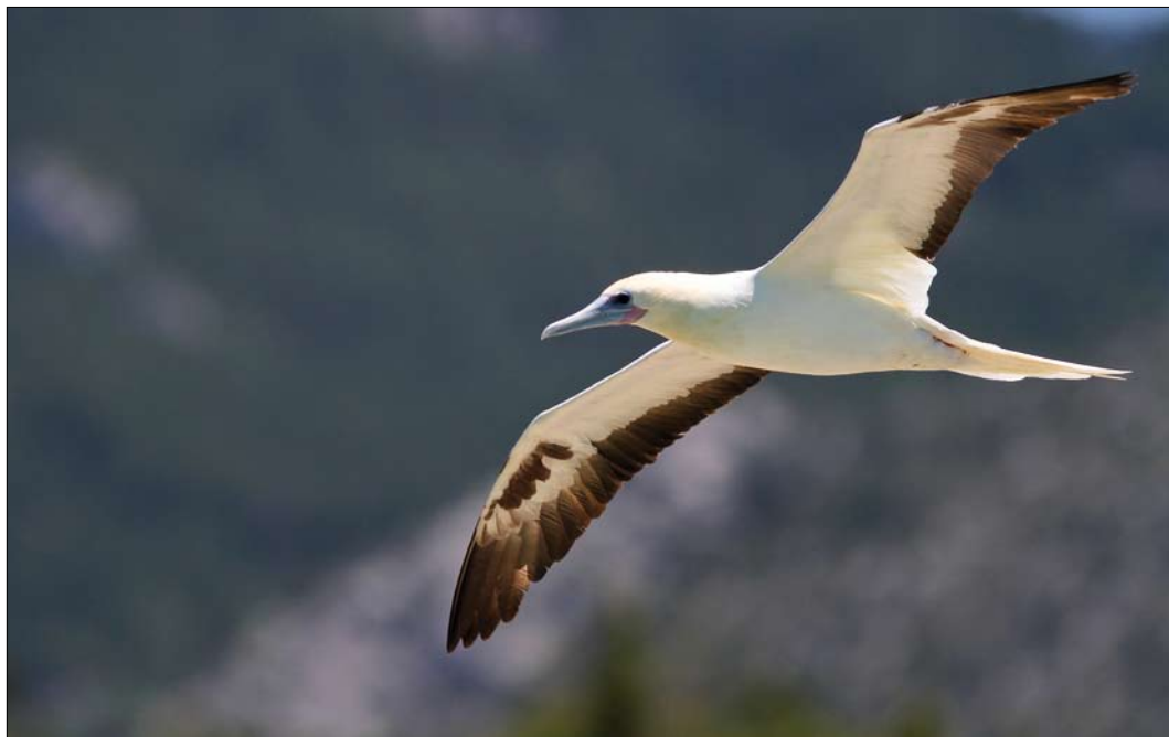
307 Red-footed Booby / Roodpootgent Sula sula , adult, Lac de Sainte-Croix, Alpes-de-Haute-Provence, France, 5 July 2011