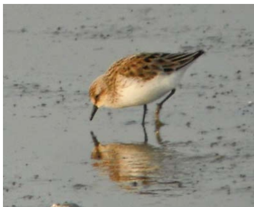
347 Lammergier / Bearded Vulture Gypaetus barbatus , onvolwassen, Den Helder, Noord-Holland, 20 juni 2011 348 Ralreiger / Squacco Heron Ardeola raloides , Limietweg, Texel, Noord-Holland, 27 mei 2011, 349 Lammergier / Bearded Vulture Gypaetus barbatus , tweede-kalenderjaar mannetje ('Sardona'), Philippine, Zeeland, 13 juni 2011 350 Grijze Strandloper / Semipalmated Sandpiper Calidris pusilla , Westpolder, Groningen, 20 mei 2011

Goed gefotografeerde exemplaren werden vastgesteld op 5 mei bij Bennekom, Gelderland; van 6 mei tot in juli op de Hoge Veluwe, Gelderland; op 7 mei bij Kinderdijk, Zuid-Holland; op 22 mei boven Roosendaal, Noord-Brabant; van 30 mei tot 3 juni op de Delleboersterheide bij Oldeberkoop, Friesland; en van 4 juni tot in juli in het Drents-Friese Wold bij Vledder, Drenthe. Ter vergelijking: in de periode 1907-95 werden slechts acht gevallen aanvaard. Waarnemingen van deze soort worden nog steeds beoordeeld door de CDNA. Een nagekomen melding betrof die van een eerste-zomer Steppiekiekendief Circus macrourus op 24 april bij Hardenberg, Overijssel. Andere exemplaren werden waargenomen op 1 mei bij Kampen, Overijssel (adult mannetje); op 1 mei bij Millingen aan de Rijn, Gelderland (adult mannetje); op 1 mei bij Slenaken, Limburg (eerste-zomer); op 2 mei een adult mannetje in Noord-Holland om 06:30 bij Heerhugowaard, om 08:28 bij de Dijkgatweide in de Wieringmeer en