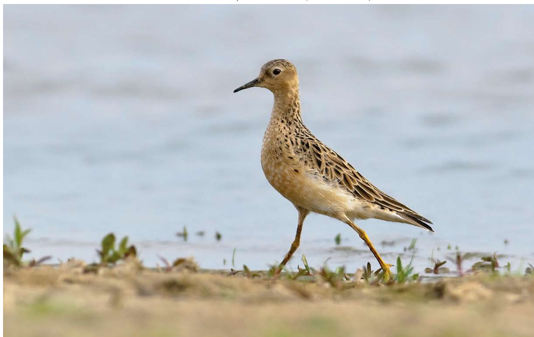
346 Blonde Ruiter / Semipalmated Sandpiper Tryngites subruficollis , Polder Hardenhoek, Brabantse Biesbosch, Noord-Brabant, 13 mei 2011