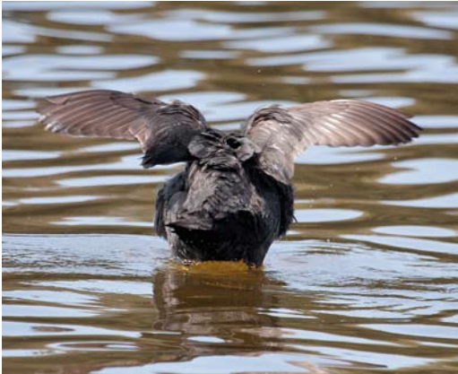
303 Hybrid Eurasian x Red-knobbed Coot / hybride Meerkooet x Knobbelmeerkooet Fulica atra x cristata , Sidi Bou-Rhaba, Morocco, 25 April 2009. Unlike Eurasian, white trailing edge to secondaries is (almost) absent.