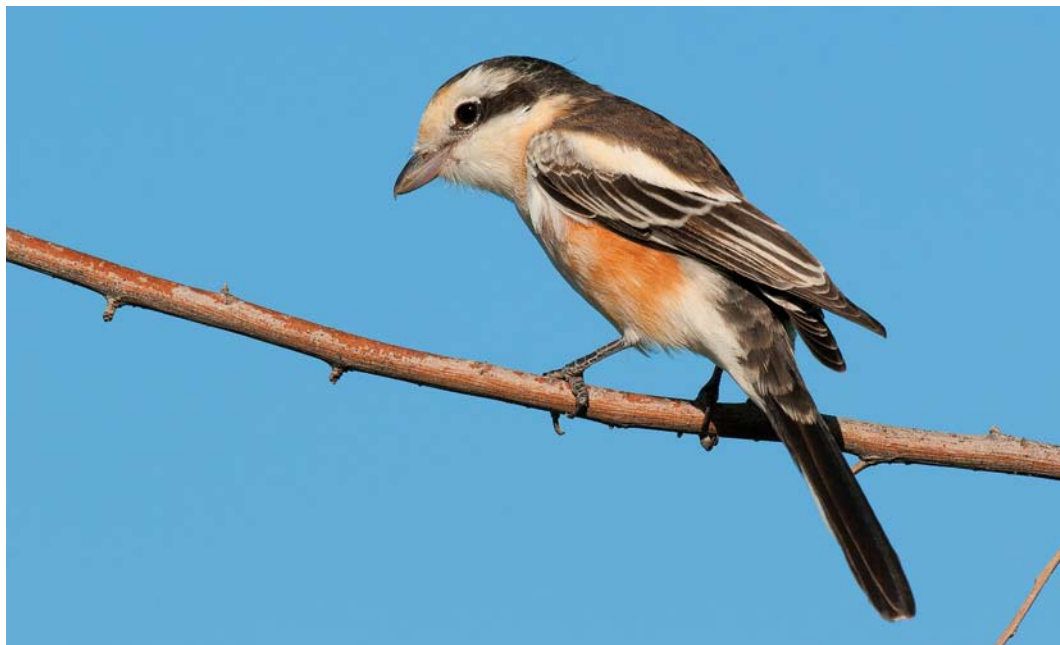
298 Masked Shrike / Maskerklawier Lanius nubicus , adult female, Fetisovo, Mangghystau province, Kazakhstan, 31 August 2010 (Arend Wassink)

winged could be excluded by the presence of streaked flanks and the pattern of black and white on the face and neck. At this point SB, RA and AS were still not aware of the status of Syrian Woodpecker in Kazakhstan, and presumed it was a resident breeder at Naurzum nature reserve. It was only after checking Wassink & Oreel (2007), almost two days after the sighting, that it was realized that the species would be an addition to the national list. This caused the observers to further investigate the identification of the bird once back at home. After more research there, the bird was firmly identified as a Syrian Woodpecker.