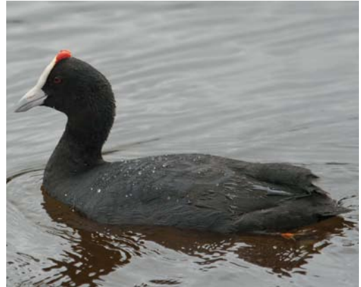
304 Red-knobbed Coot / Knobbelmeerkooet Fulica cristata , Sidi Bou-Rhaba, Morocco, 25 April 2009 (Peter Adriaens)