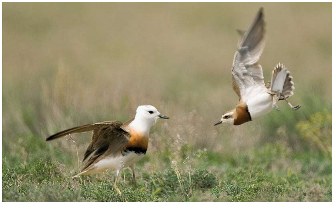
293 Oriental Plover / Steppeplover Charadrius veredus , adult male, with Caspian Plover C. asiaticus , adult male, Atanbaschik semi-desert, Aqtöbe province, Kazakhstan, 9 May 2009

The relatively fresh primaries in combination with the well-developed breast pattern indicated that the bird was an adult. First-summer males show very worn primaries and usually attain a dull breast band (Prater et al 1977).