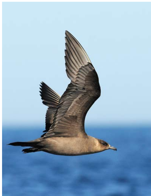
282 Arctic Jaeger / Kleine Jager Stercorarius parasiticus , off southern Portugal, 22 September 2009

algarvebirdman.com, www.birdwatching-algarve.com and www.marilimitado.com. More information on sightings of Wilson's Storm Petrels in the area can be found at www.club300.de/articles/008_wilsons/index.html (with many links to related websites about Wilson's Storm Petrel and pelagic trips off coastal Europe).