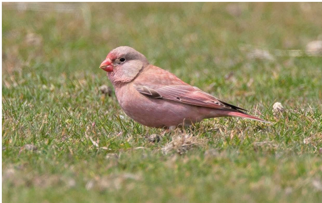
329 Trumpeter Finch / Woestijnvink Bucanetes githagineus , male, Lundy, Devon, England, 14 May 2011