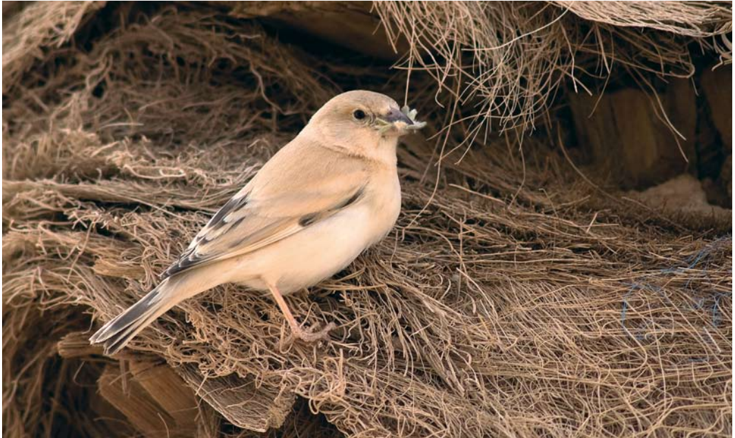
172 Desert Sparrow / Afrikaanse Woestijnmus Passer simplex saharae , female, Merzouga, Tafilalt, Morocco, 30 March 2004

qualifies for Red Data listing, given that its core range is now potentially rather small and shows evidence of having declined in recent decades.