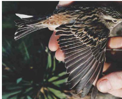
5 Pine Bunting / Witkopgors Emberiza leucocephalos , first-winter male, Duna di Migliarino, Toscana, Italy, 17 December 1995. Note heavy dark grey-brown streaking on underparts, and conspicuous dark spots on upper breast. 6 Pine Bunting / Witkopgors Emberiza leucocephalos , first-winter female, Katwijk, Zuid-Holland, Netherlands, 25 November 1996 7 Pine Bunting / Witkopgors Emberiza leucocephalos , adult-winter female, Duna di Principina, Toscana, Italy, January 2001. Note typical pale nape spot bordered by two dark stripes, and streaked crown with paler median stripe. 8 Pine Bunting / Witkopgors Emberiza leucocephalos , first-winter female, Duna di Migliarino, Toscana, Italy, December 1995. Note uniformly streaked crown, brown cheeks and ear-coverts contrasting with the whitish supercilium, pointed tail-feathers, worn juvenile tertials, juvenile primary coverts and grey-brown lesser coverts.

Bunting is strikingly different from that of Yellowhammer, more contrasting and totally lacking yellow pigments. There are often reddish tones to the supercilium and throat. Pine Bunting's crown shows finer, neater dark streaking; these streaks are usually more evident on the sides of the crown, while on the centre the streaks are thinner and less conspicuous, on a paler background. The pattern is thus similar to that of males. In adult-winter female, the median crown-stripe is generally more streaked and less