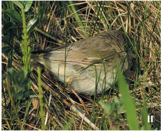
Mystery photograph II (May)