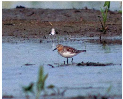
324 Black-winged Pratincole / Steppevorkstaartplevier Glareola nordmanni , adult, Hooge Zwaluwe, Noord-Brabant, 2 July 1998 (Hans Gebuis) 325 Black-winged Kite / Grijze Wouw Elanus caeruleus , Eierlandse Duinen, Texel, Noord-Holland, 30 March 1998 (René van Rossum) 326 Hutchins's Canada Goose / Hutchins' Canadese Gans Branta hutchinsii hutchinsii , Bandpolder, Friesland, 25 April 1998 (Roef Mulder) 327 White-headed Duck / Witkoppeend Oxyura leucocephala , Nieuwe Diep, Amsterdam, Noord-Holland, 21 January 1998 (Arnoud B van den Berg) 328 Terek Sandpiper / Terekruiter Xenus cinereus , adult, Camperduin, Noord-Holland, 10 October 1998 (Jan den Hertog) 329 Red-necked Stint / Roodkeelstrandloper Calidris ruficollis , adult, Oud-Beijerland, Zuid-Holland, 4 July 1998 (Hans Gebuis)