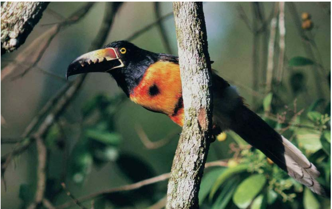
363 Collared Aracari / Halsbandarassari Pteroglossus torquatus , Tikal, Guatemala, 15 August 1998 (Marc Guyt)